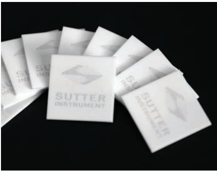
Ceramic tile for scoring glass