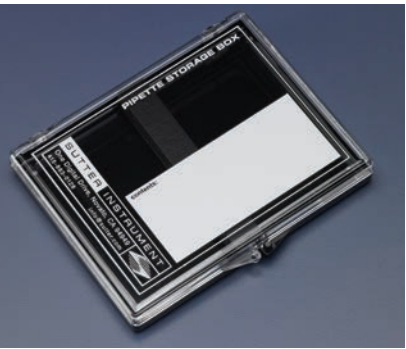
Pipette storage box