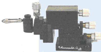
525 Series Manipulators